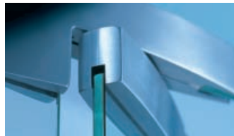
Glass Fittings and Accessories